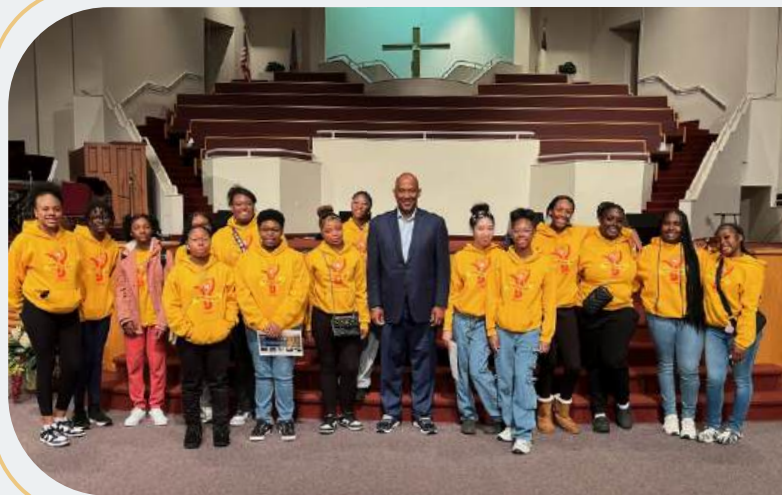
2024 National Service Opportunity Fair

For the latest on upcoming events, community resources, and more, make sure to subscribe to my e-newsletter for the latest PA-03 updates!