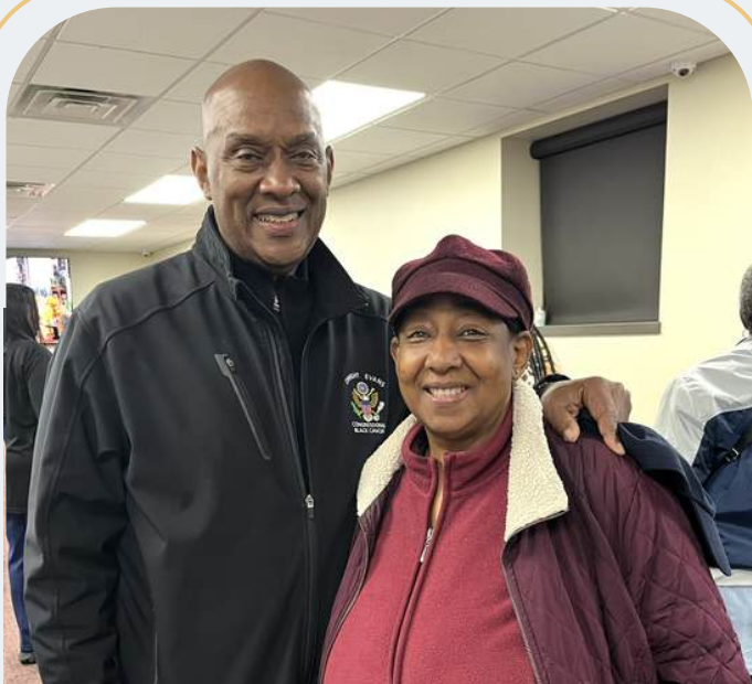
2024 Seniors Resource & Wellness Fair

Helped seniors connect with adult service organizations such as Social Security and Medicare