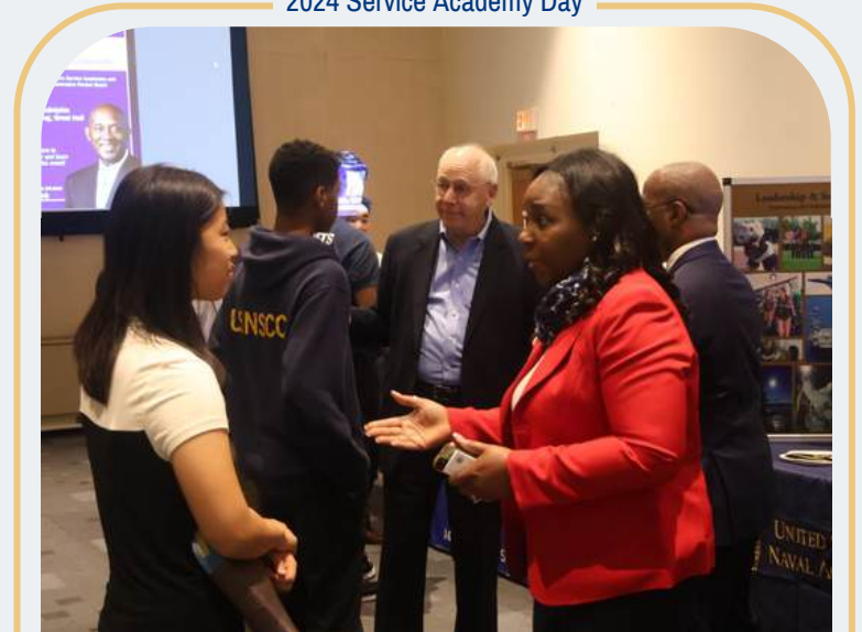
2024 Service Academy Day

Each year my office hosts a Service Academy Day for students interested in learning more about Service Academies and our office's nomination process. Join us in 2025 if you want to learn more about this opportunity.